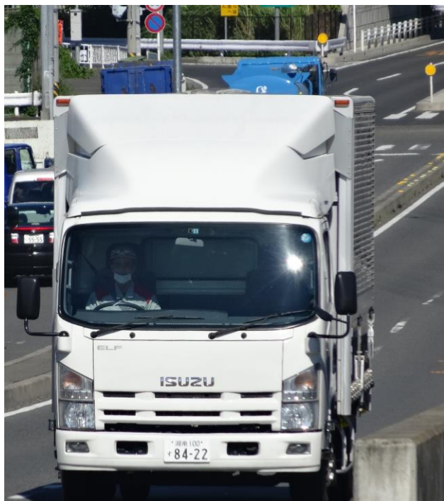
First DME Truck Registered in Japan

The AMFI Newsletter is prepared for the members of the Implementing Agreement for Advanced Motor Fuels of the International Energy Agency (IEA/AMF). The AMFI releases four electronic newsletters each year.